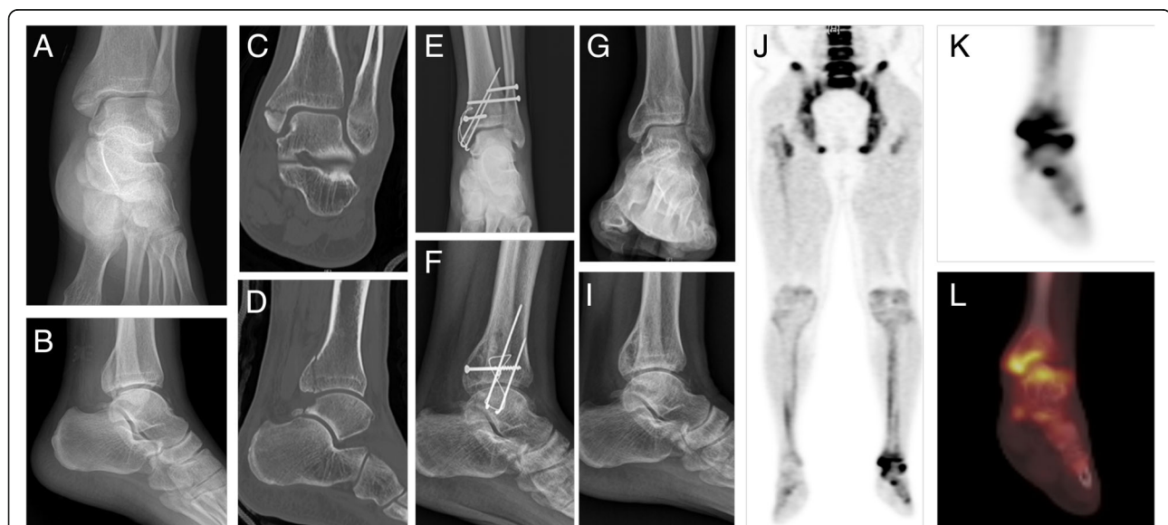
Fig. 1 Radiological and 18 F-Sodium fluoride ( 18 F-NaF) positron emission tomography-computed tomography (PET/CT) images of a 37-year-old male patient who had a fracture of the left medial and posterior malleolus of the tibia. a-d Initial images of plain radiographs and computed tomography (CT); a ankle anterior-posterior view, b ankle lateral view, c ankle CT coronal view, d ankle CT lateral view. Note that the fracture involved the talocrural (tibiotalar) joint. e, f Plain radiographs after internal fixation with a metal pin. g-i Plain radiographs performed at 17 months after injury presents pin removal status and osteoporotic changes around the ankle joint, but does not provide any information about the degree of ankylosis in the ankle. j-l 18 F-NaF PET/CT shows hot uptake around the talocrural joint near the initial fracture area

According to our retrospective study of 18 F-NaF PET/CT findings, most patients with limited ROM after ankle trauma (113/121 = 93.4%) showed hot uptake around the ankle joint. However, several cases (8/26 = 30.8%) in the non-fracture group did not reveal hot uptake on PET/CT, and even if some hot uptake was observed, there