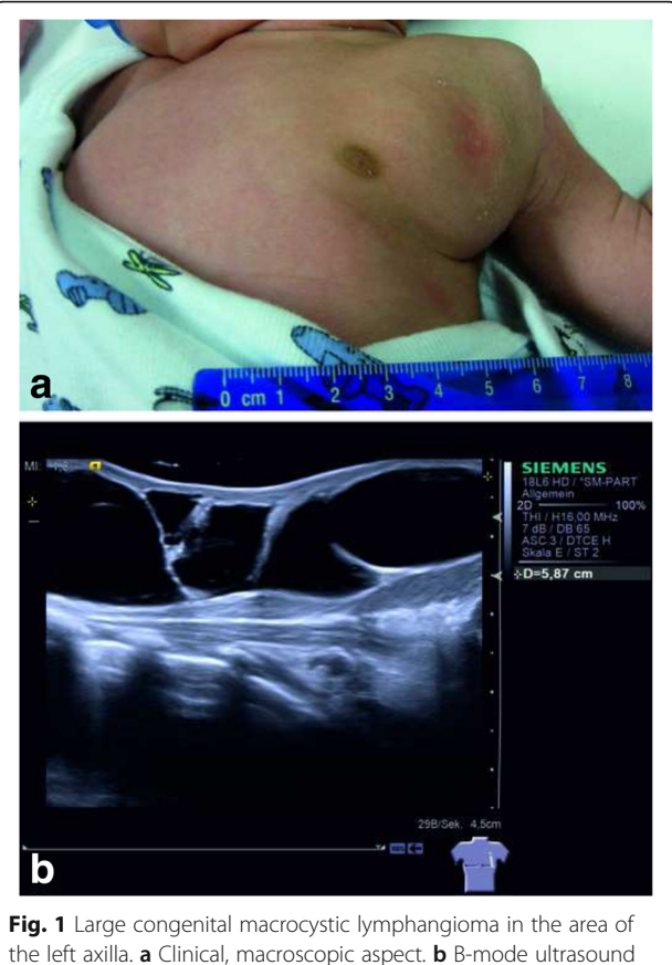
the left axilla. a Clinical, macroscopic aspect. b B-mode ultrasound showing the typical finding of a subcutaneous tumor with multiple homogenous anechoic cysts

0.9%) was performed via the same catheter. Expectedly one day after intervention fever and a local swelling occurred. C-reactive protein (CRP) increased up to 104 g/dl, normalizing five days after injection. An antibiotic therapy with piperacilline and tobramycin was applied for seven days. Sonographic follow-up examinations showed that the cysts became more solid, accompanied by a subcutaneous edema. Three weeks after intervention we saw a significant involution of the lymphangioma (Fig. 3a). After eight weeks only few singular cysts up to 3 mm (Fig. 3b) could be depicted by sonography.